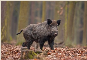
Wild Boar (Europe)