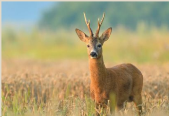
Buck/Roe Buck/Roe Deer (Europe)