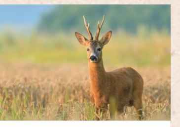
Buck/Roe Buck/Roe Deer (Europe)