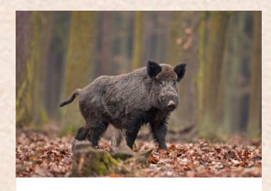
Wild Boar (Europe)