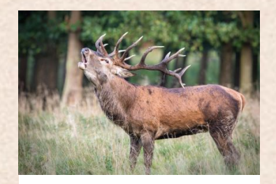
Red Deer/Red Stag (Europe)