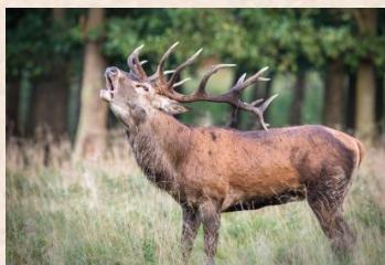
Red Deer/Red Stag (Europe)