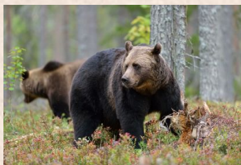
Brown Bear (Europe)