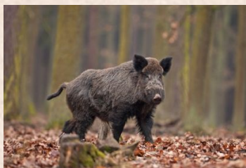
Wild Boar (Europe)