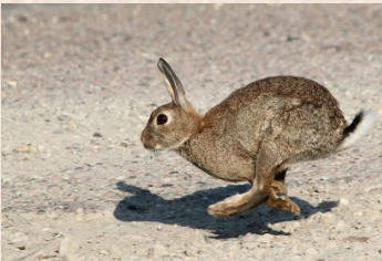
Rabbit, European Wild