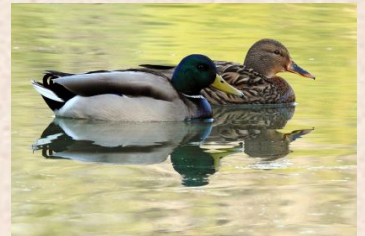
Duck / Mallard