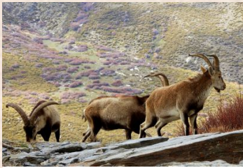
Sierra Nevada Ibex