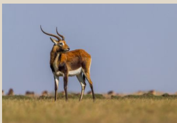
Red Lechwe/Black Lechwe/Kafue