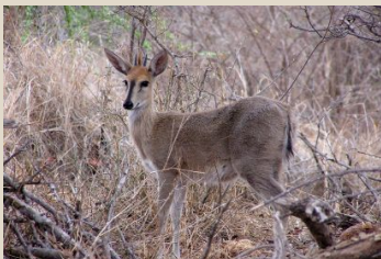
Duiker, Grey/Duiker, Grimm's (Common)