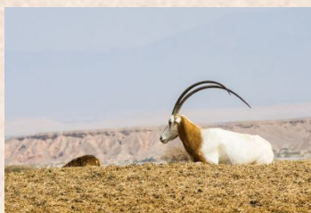
Scimitar Oryx/Scimitar- Horned Oryx