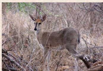
Duiker, Grey/Duiker, Grimm's (Common)