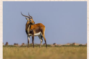
Red Lechwe/Black Lechwe/Kafue