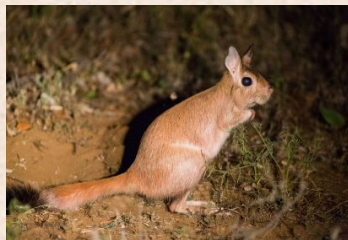
South African springhare