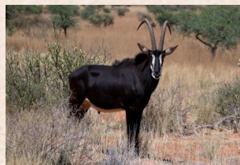
Sable Antelope (Africa)