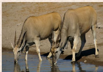
Eland, Cape/Livingstone, Patterson's