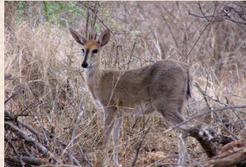
Duiker, Grey/Duiker, Grimm's (Common)