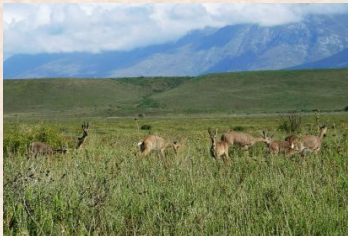
Grey Rhebok/Vaal Rhebuck