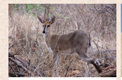
Duiker, Grey/Duiker, Grimm's (Common)