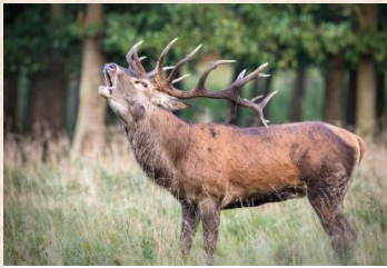
Red Deer/Red Stag (Europe)