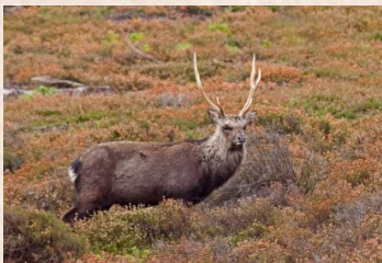
Sika Deer (Europe)