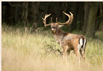
Fallow Deer (Europe)