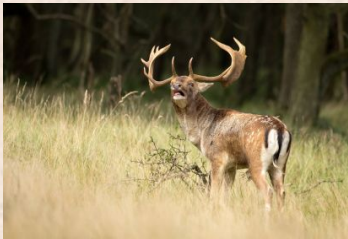
Fallow Deer (Europe)