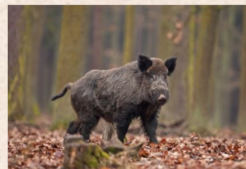
Wild Boar (Europe)