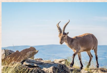
Ibex, Spanish (Europa)