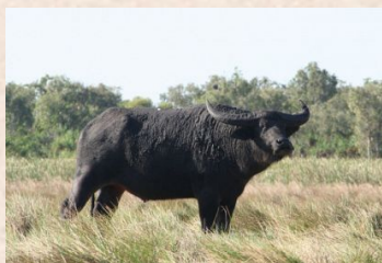
Wild Water Buffalo (Oceania)