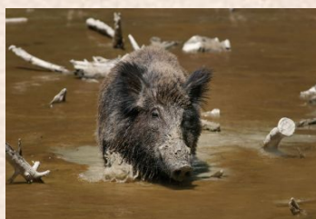
Wild Boar (Oceania)