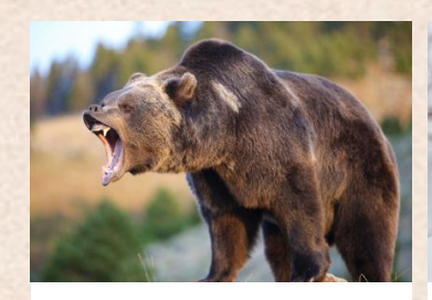
Brown Bear/Grizzly (North America)