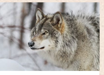
Wolf (North America)