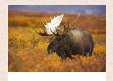
Moose (North America)