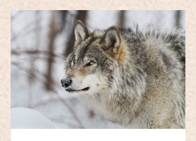
Wolf (North America)