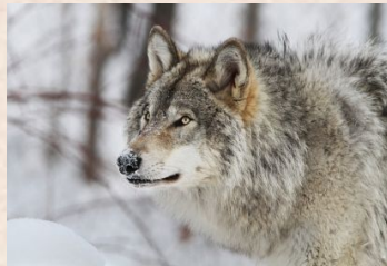
Wolf (North America)