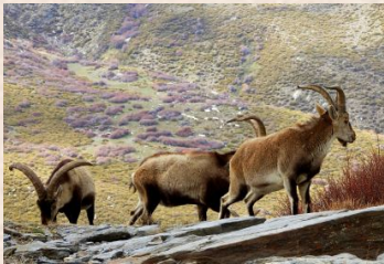
Sierra Nevada Ibex