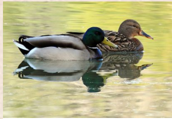
Duck / Mallard