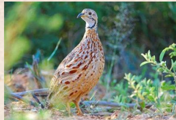
Orange River francolin