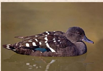
African Black duck*