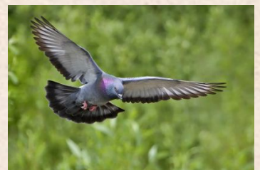
Dove, Rock-/Pigeon, Blue Rock-