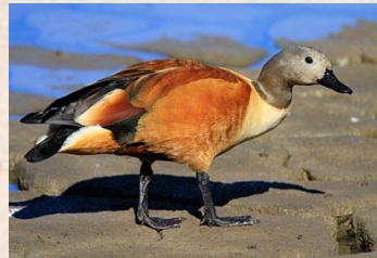
South African Shelduck*