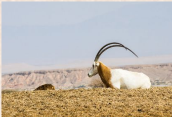
Scimitar Oryx/Scimitar-Horned Oryx