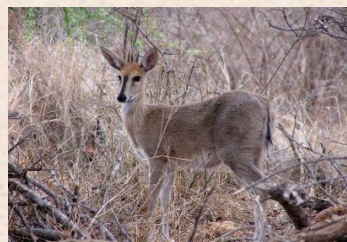
Duiker, Grey/Duiker, Grimm's (Common)