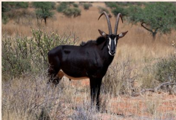
Sable Antelope (Africa)