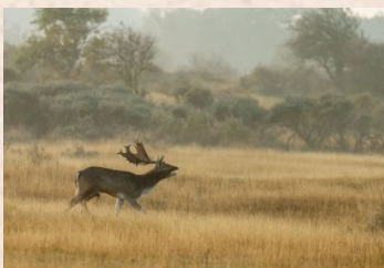
Fallow Deer (South America)