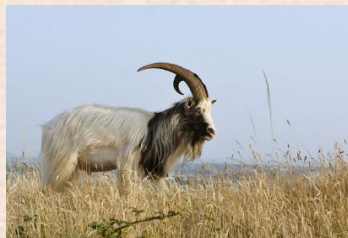
Feral Goat (South America)