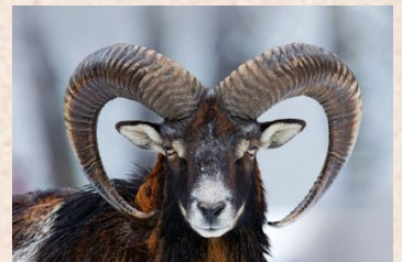
Mouflon (South America)