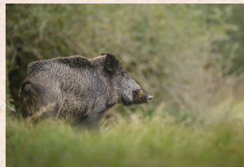
Wild Boar (South America)