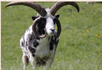
Multi-horned sheep (South America)