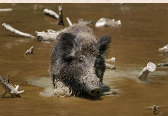
Wild Boar (Oceania)