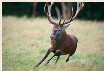
Red Deer/Red Stag (Oceania)