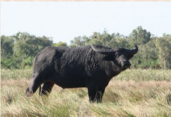
Wild Water Buffalo (Oceania)