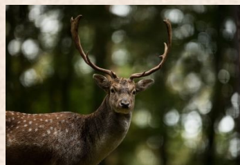
Fallow Deer (Oceania)