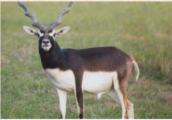
Blackbuck Antelope (Oceanien)