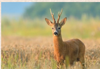
Buck/Roe Buck/Roe Deer (Europe)