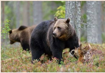
Brown Bear (Europe)