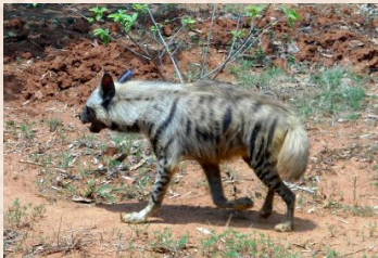
Hyena, Striped (Oceania)