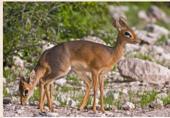
Kirk's Long Snouted Dik-Dik