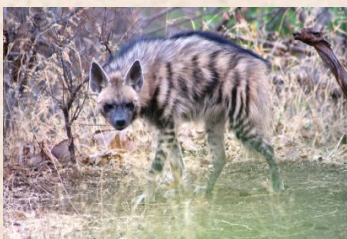
Striped Hyena (Asia)