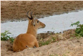
Reedbuck, Bohor/Reedbuck, Bohor