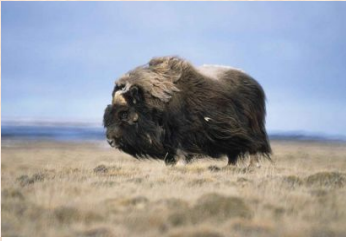
Musk Ox (North America)