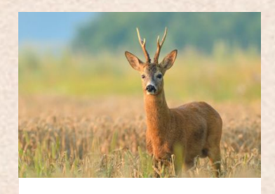
Buck/Roe Buck/Roe Deer (Europe)