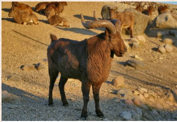
Tur, East Caucasian/Dagestan Tur