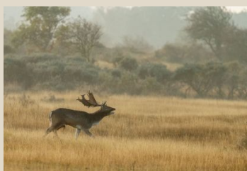
Fallow Deer (South America)