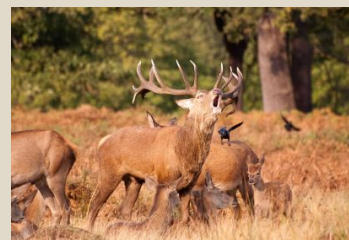
Red Deer/Red Stag (South America)