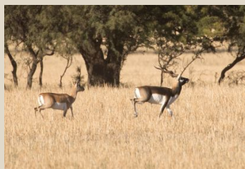
Bezoar Antelope/Black Buck