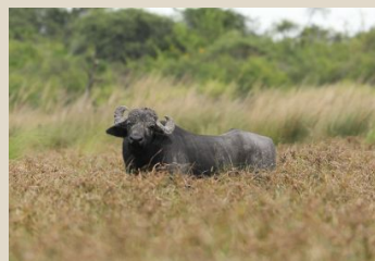
Water Buffalo (South America)