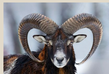
Mouflon (South America)