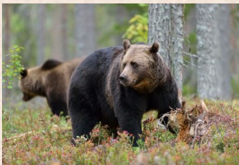
Brown Bear (Europe)