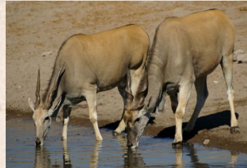
Eland, Cape/Livingstone, Patterson's