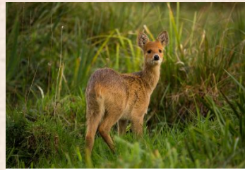
Chinese Water Deer