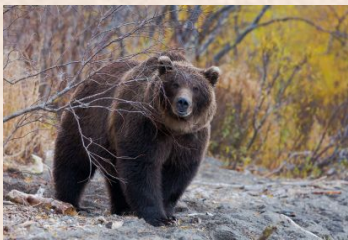
Brown Bear (Asia)