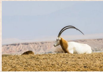
Scimitar Oryx/Scimitar- Horned Oryx