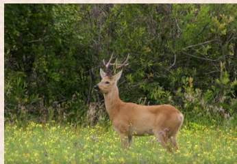
Siberian Roe Deer