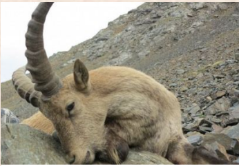
Tur, West Caucasian